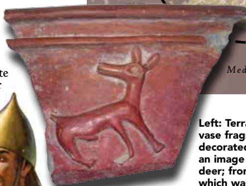
Left: Terra-cotta vase fragment decorated with an image of a deer; from Alishar, which was part of the Hittite Empire; dated 1600–1400 B.C.