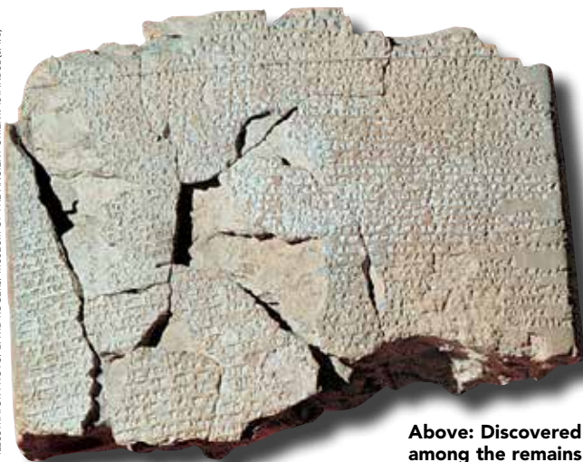
Above: Discovered among the remains of royal archives of Boyuk Kale at Bogazkoy; the Treaty of Kadesh (dated 1296 B.C.)

the second-millennium Anatolian kingdom most scholars today refer to them as 'Neo-Hittites.' 2 The fourth ethnic group of people known as Hittites is the Hittites of the Old Testament, the people who lived in the land of Canaan.