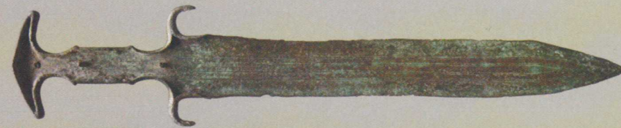
Ur's Early Dynastic III (2600-2500 B.C.)