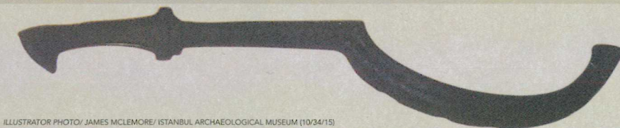
Mycenaean (1300-1100 B.C.)